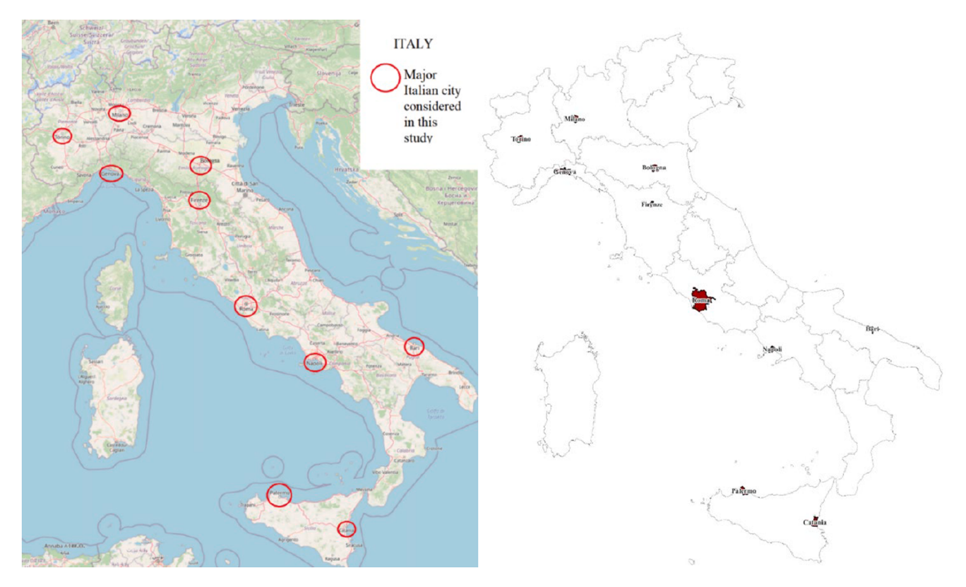
Fig. 1. Location of major Italian cities in terms of population (>300,000 inhabitants) on the left and their area width on the right (highlighted in red). (For interpretation of the references to colour in this figure legend, the reader is referred to the web version of this article.)