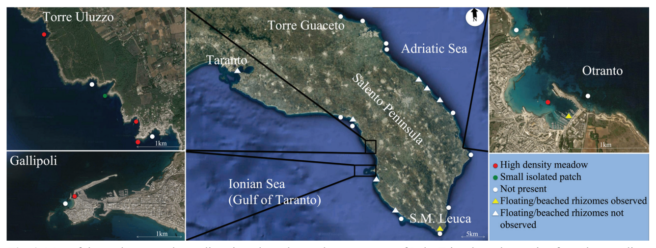
Fig. 1: Map of the study area and sampling sites along the southeastern coast of Italy. Triangle = observation from the coastline; circle = diving site.

In December 2021, tens of H. stipulacea rhizomes were observed beached and floating in the harbor of Otranto two days after an intense storm; the survey of other ports and beaches of the Salento Peninsula (from Taranto to Torre Guaceto) from the ground did not reveal the presence of any plant fragments nor floating or washed ashore, except for the port of Santa Maria di Leuca where two floating rhizomes were observed. Diving inside the port of Santa Maria di Leuca was impossible due to logistic constraints, while the underwater investigation outside the port did not detect any meadow/patch. (Fig. 1; Table 1).