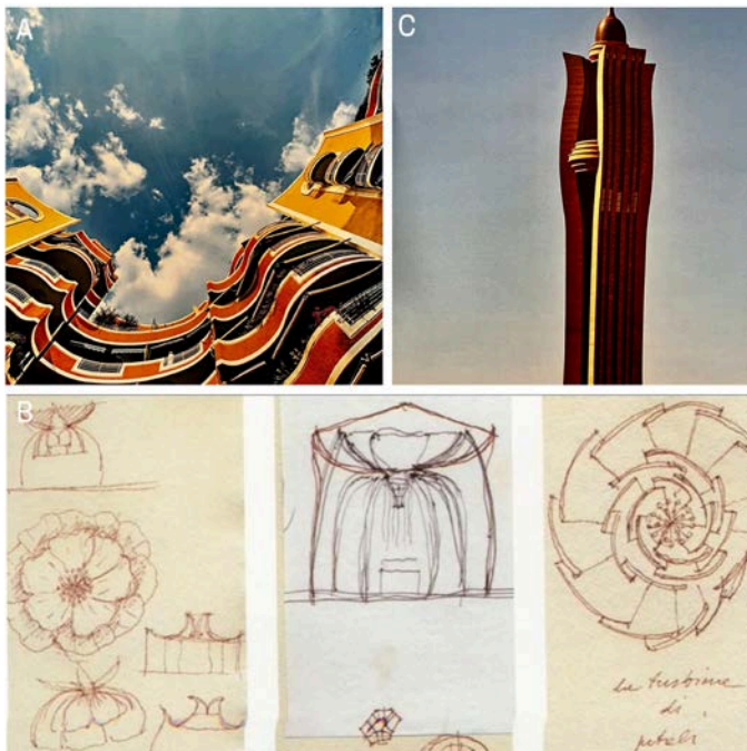
Figure 3a. P. Portoghesi, View of the Belvedere “Le Dalie” complex (Rome, 2019) ; Figure 3b. P. Portoghesi, Studies on the theme of the rose ; Figure 3c. P. Portoghesi, Project for the Breathing Tower in Shanghai ;