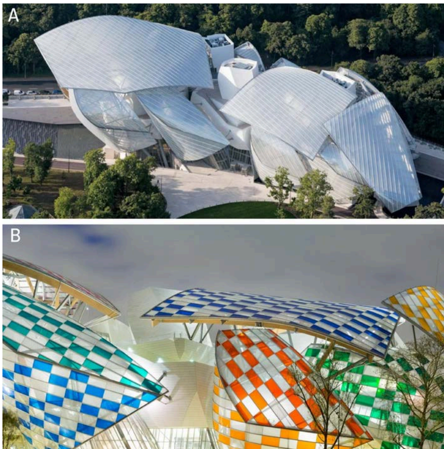
Figure 4a. F. Gehry, View of the Louis Vuitton Foundation (Paris, 2014) ; Figure 4b. D. Buren, Observatory of Light, Louis Vuitton Foundation (Paris, 2016)

Observing other works by Gehry (such as, for example, the extraordinary case of the Hotel Marqués de Riscal in Elciego) 50 , it is possible to think that after all, Bruno Taut's utopia is not so unrealizable, and that architecture can flourish in a natural way. Gehry's flowers are humanized buildings, implicit metaphors for a peculiar conception of the world. His architectures lead the visitor to interface with his own nodes, passing through a seemingly hostile, decomposed, unbalanced and inexorably closed environment. It is only by looking at the building with a conscious gaze, from above and from afar , that one perceives instead that the architect has made a piece of the city flourish.