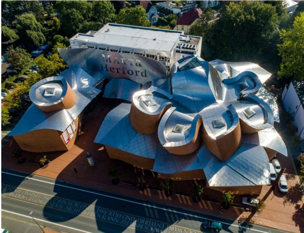
Figure 5. F. Gehry, Aerial View of the Marta Museum (Herford, 2005)