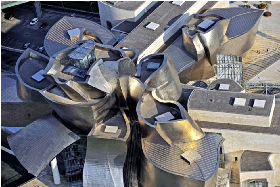
Figure 6. F. Gehry, Aerial View of the Guggenheim Museum (Bilbao, 1997)