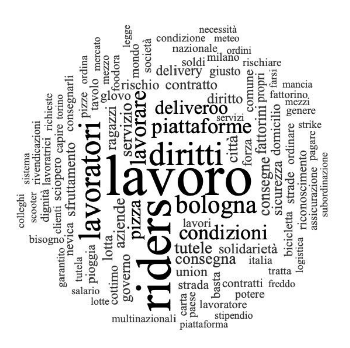
Fig. 4 - Word cloud of 100 most used word in Riders Union Bologna Facebook page (October 2017-April 2019)

protecting workers and promoting an ecological and sustainable mobility». After this, the municipality has called together the main platforms operating in the city at that time (Just Eat, Deliveroo, Glovo, Foodora and Sgnam) and later elaborated the «Bill of Rights of Digital Workers in Urban Contexts».