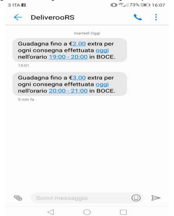
Fig. 3 - Frank's message to Deliveroo fleet during 1st May rider's strike

of its riders telling them that an extra payment was going to be corresponded that very day. Through these practices, platforms are somehow depriving typical and traditional forms of strike of meaning and effectiveness.